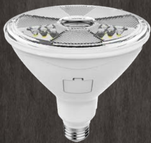
PAR Lamp - 2 Angle