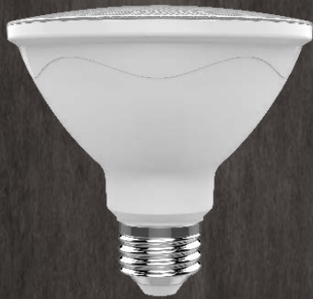
PAR Lamp - General