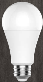
A Lamp - General CEC