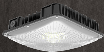
LED Canopy Light Curve Shade