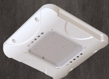
LED Canopy Light Square