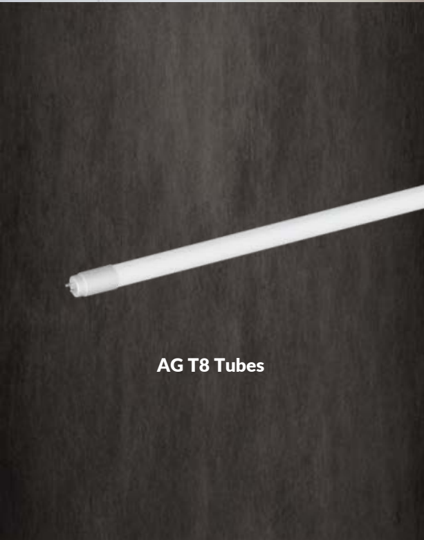
AG T8 Tubes