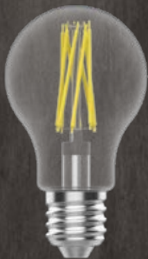
EE Class-A Filament