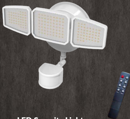
LED Security Light