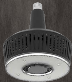
HID replacement Apollo E40