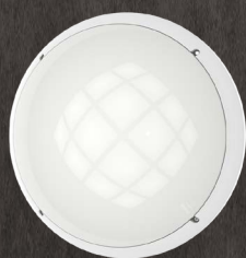
Fizz Bulkhead D250 Fizz Bulkhead D300 Fizz Bulkhead D330