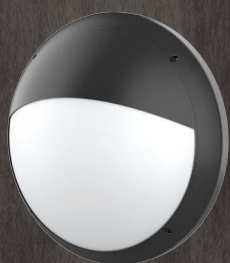
Fizz Bulkhead D300