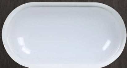
Eco Bulkhead W145