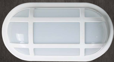
Eco Bulkhead W115