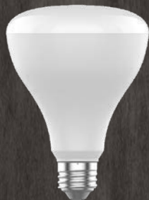
BR Lamp – General