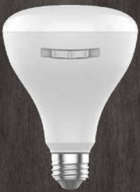
BR Lamp – 5CCT