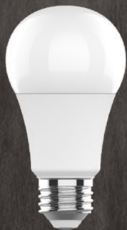
A Lamp - General M4