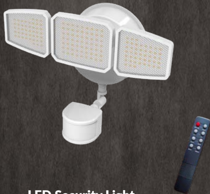
LED Security Light