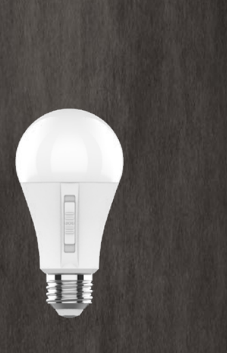
A Lamp - General CEC&5CCT