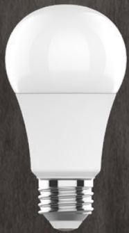
A Lamp - General OPP G3