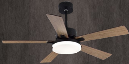
LED Ceiling Fans 52 Inches Wooden Blade