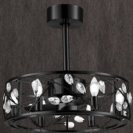
LED Ceiling Fans 20 Inch Cage